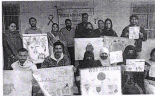
Red Ribbon club members during concluding function of week long activities at PG College Rajouri.

At national level, the programme was launched in virtual mode by the National Aids Control Organization (NACO), a divi-