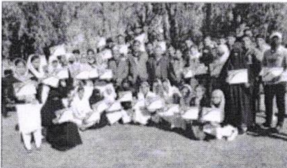
NSS volunteers during concluding function of special camp at PG College Rajouri.